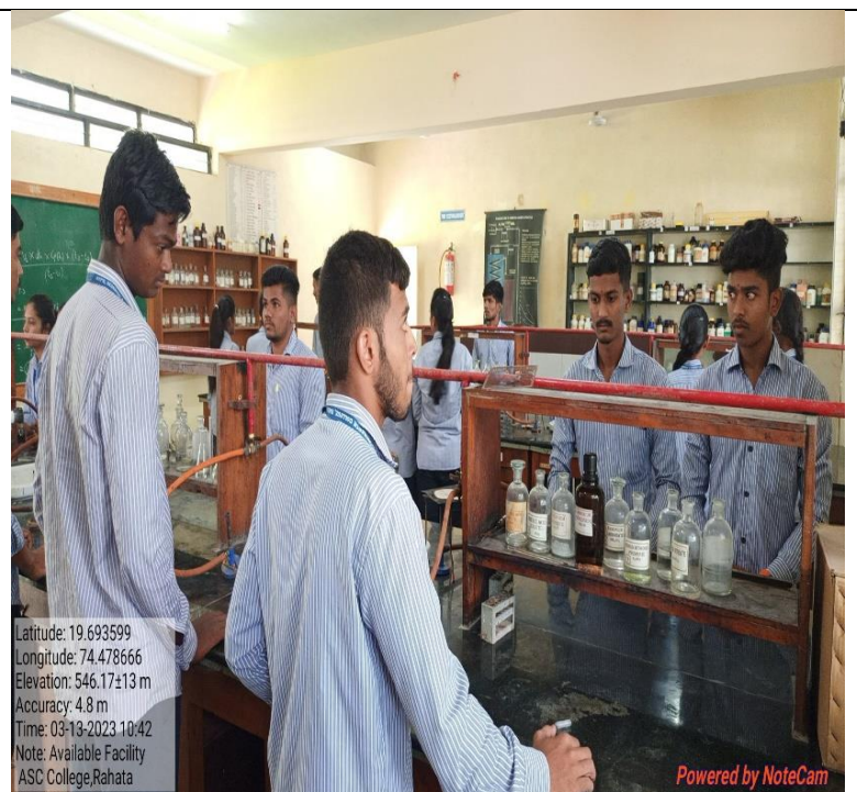
G-5 CHEMISTRY LAB-3