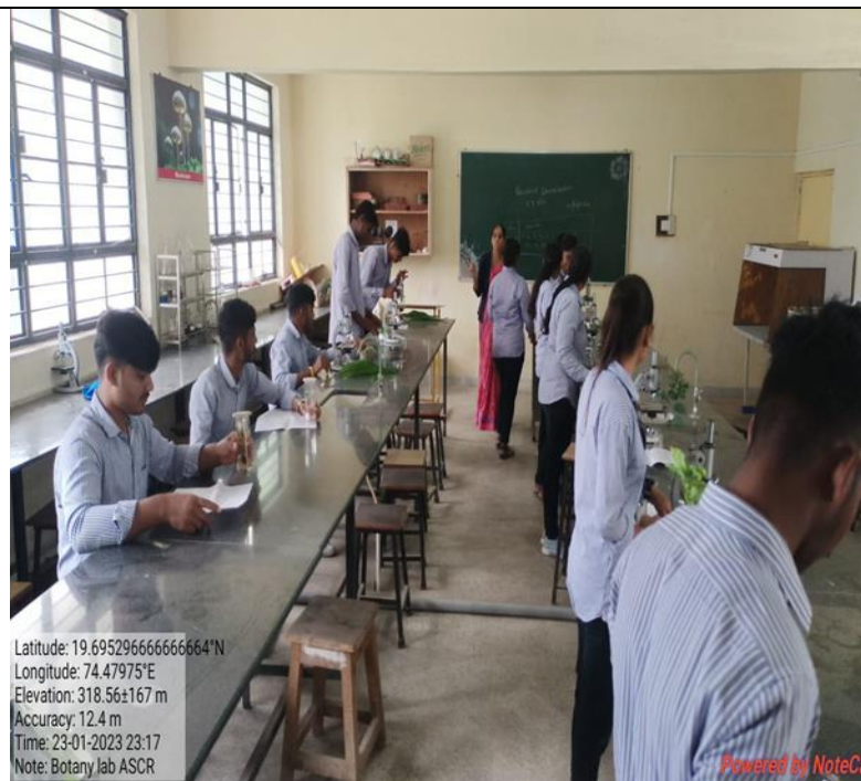
G-14 BOTANY LAB