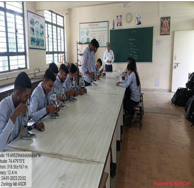
F-11 ZOOLOGY LAB -1