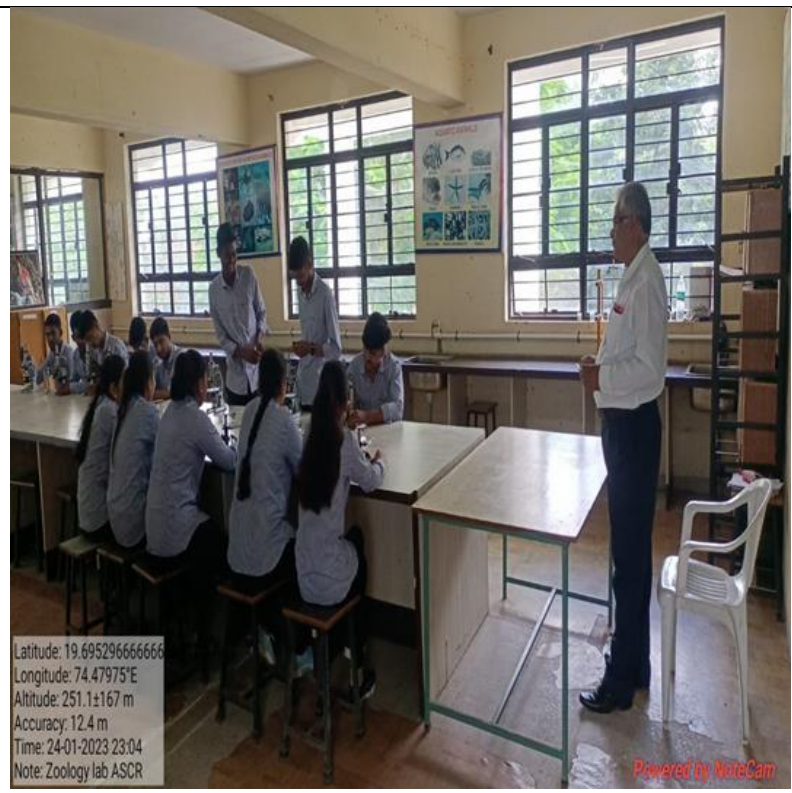
F-12 ZOOLOGY LAB -2