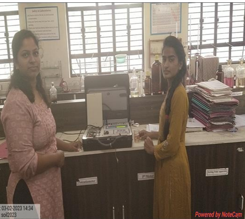
G-3 CHEMISTRY LAB-1