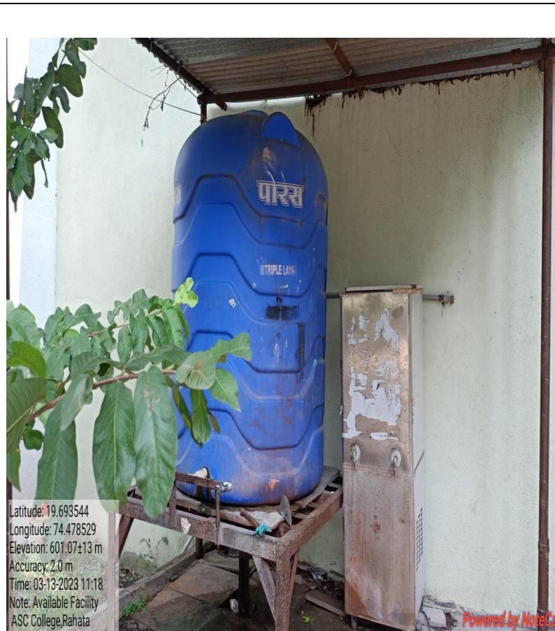
DRINKING WATER COOLING SYSTEM