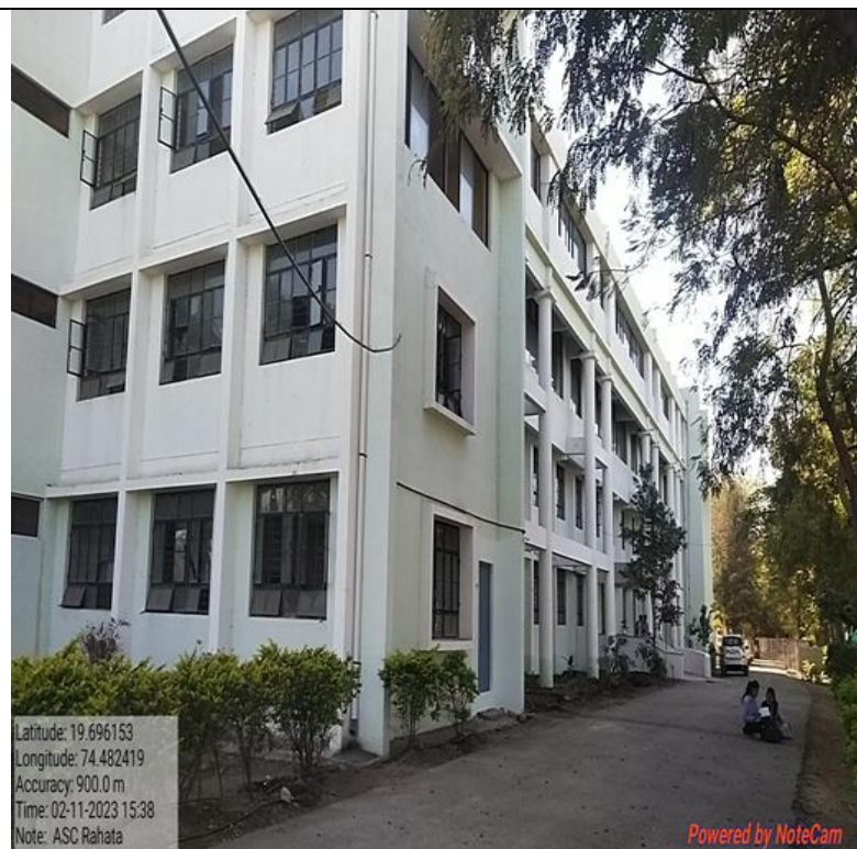
ENTRANCE OF COLLEGE