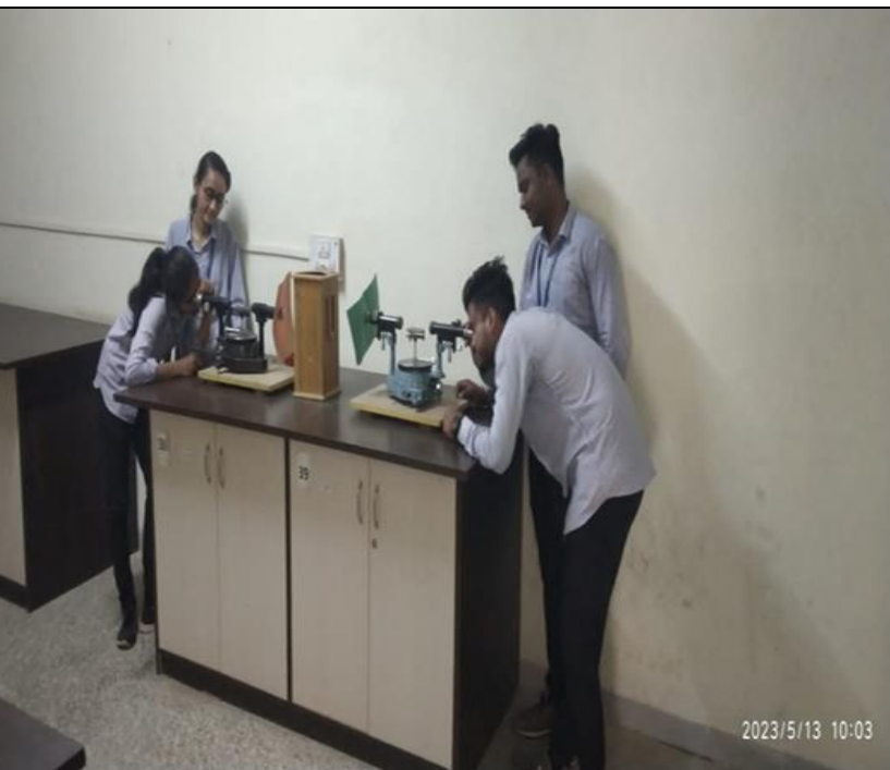
F-5 PHYSICS LAB