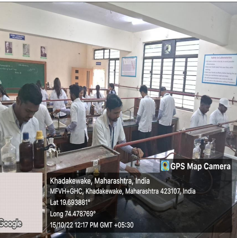
G-4 CHEMISTRY LAB-2