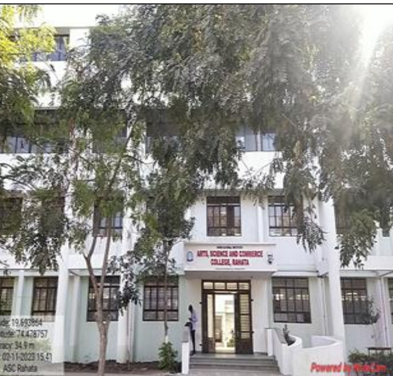
ASC COLLEGE RAHATA