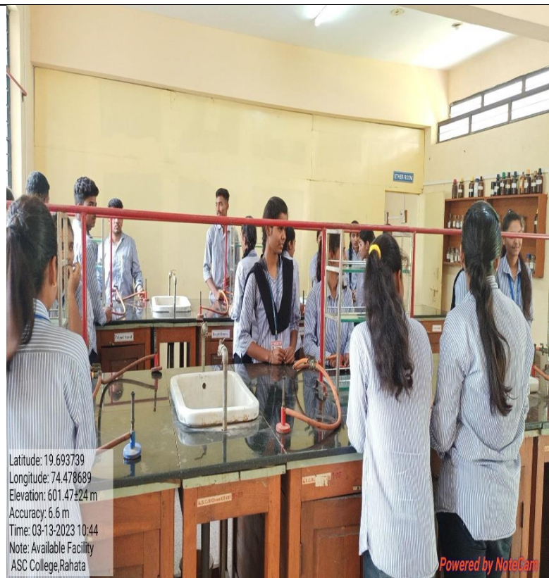
G-6 CHEMISTRY LAB-4